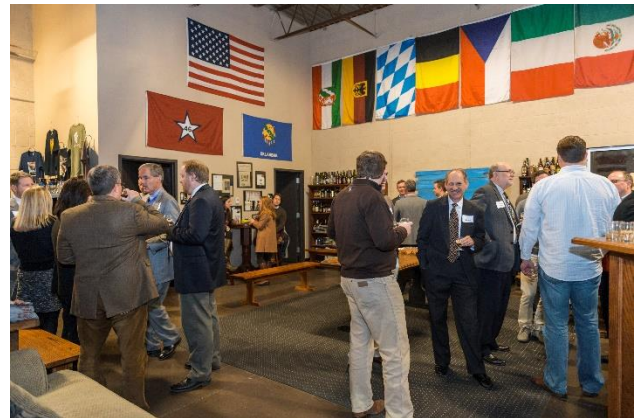
"Members Only" event December 2, 2014

Become a member today to be sure you can join us for the next "Members Only" event.