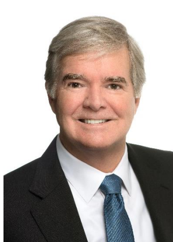
Mark Emmert President NCAA April 19, 2017